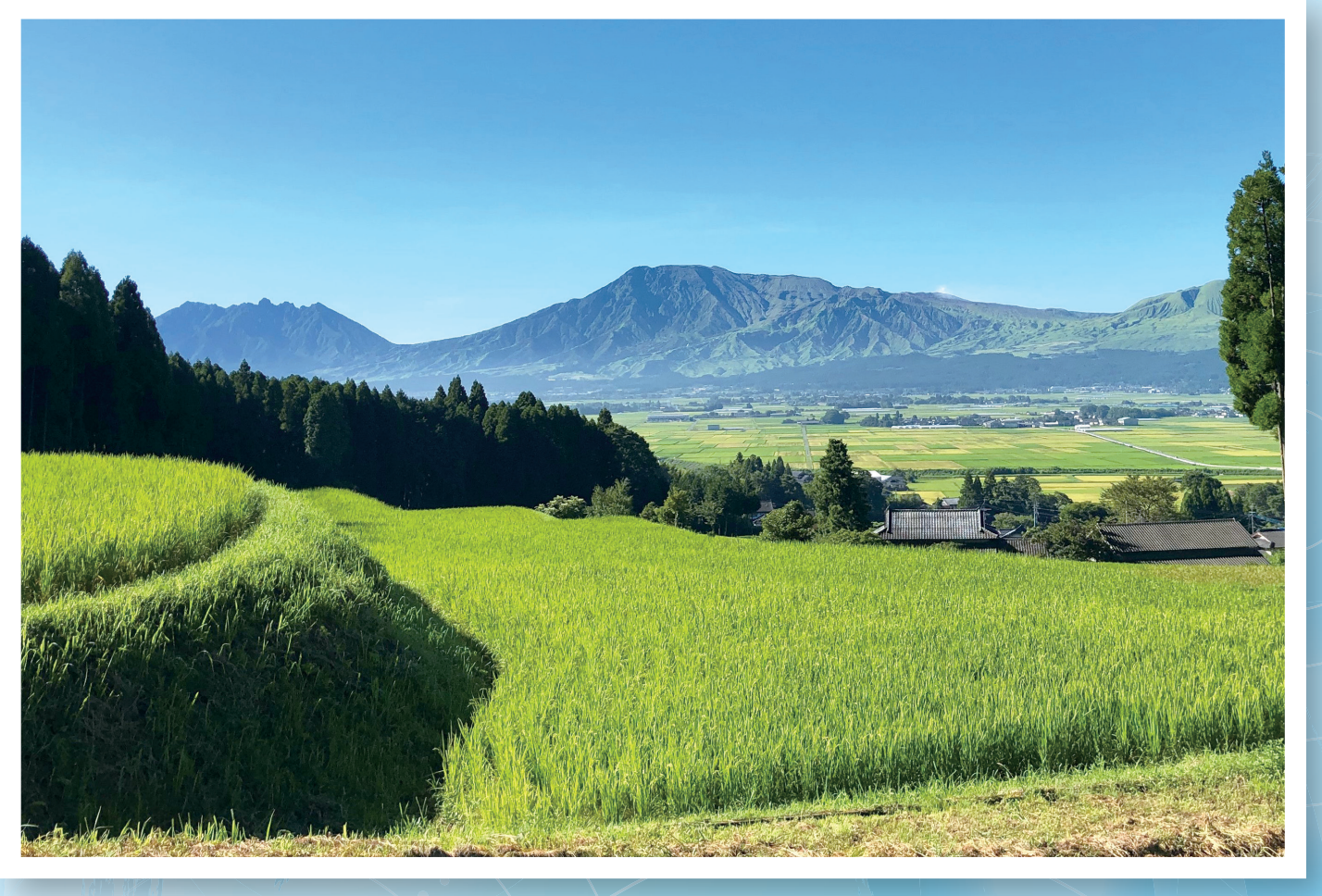
Aso Mizukake no Tanada

Purpose: To protect both the quality and quantity of local water resources, contribute to green promotion and the preservation of greenery, and create a rich local culture