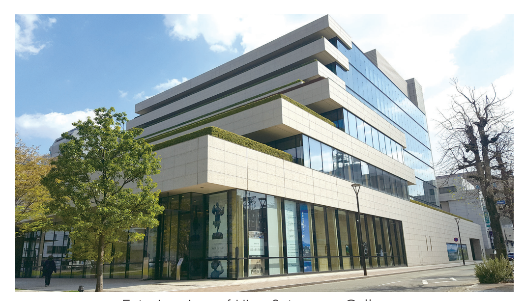
Exterior view of Higo Satoyama Gallery

It was established in 2015 as a place to deepen understanding and familiarity with the cultural products and natural climate of Kumamoto, and as a base of disseminating cultural information.